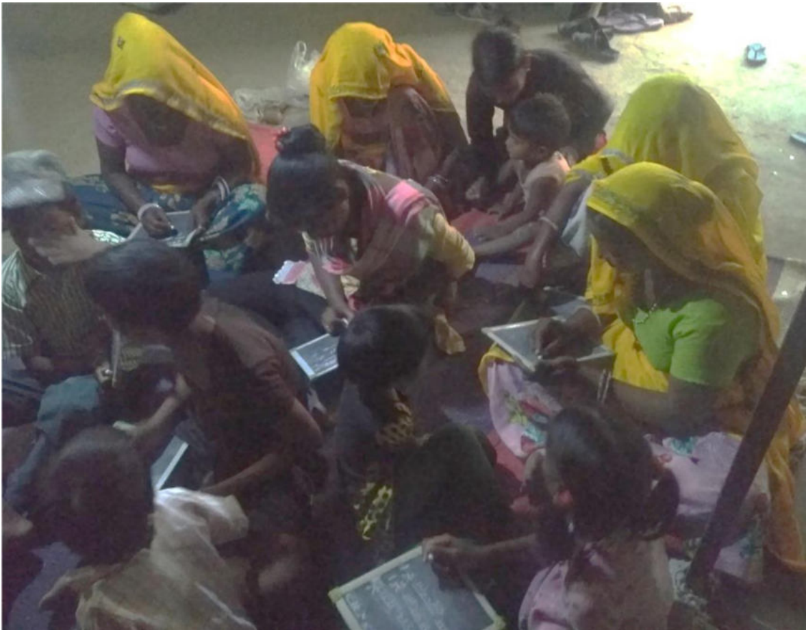
Women entrepreneurs practicing Hindi alphabet on slates in Koliyon ki dhaani

The evening school of non-formal education for the women artisans was continued during the year in village Koliyon ki Dhaani with support of Evangelische kirchengemeinde, Kobe-Osaka, Kobe Union Church and Onfilia Co. Ltd., Japan. This was the fifth year of the School where the women entrepreneurs and their girls engaged in weaving Durr (cotton mats) are learning how to read and write in addition to get knowledge on various issues related to their life and surrounding. Thirty women are taking part in the evening School.