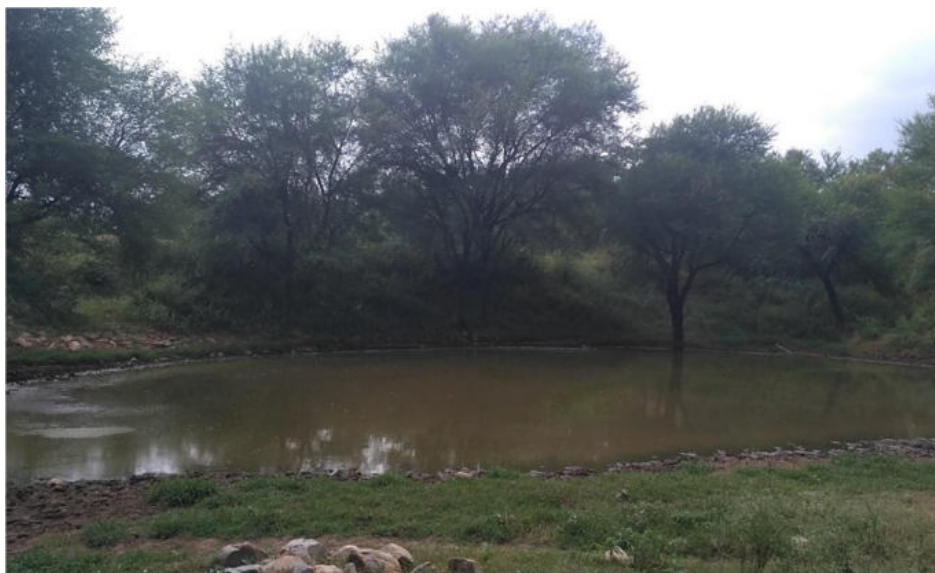
Rain water conserved by constructing check dam

It is well known fact that the trees act as efficient interceptors or scavengers of atmospheric particles i.e. SO 2 , NO x , O 3 etc. Canopy interception of airborne pollutants is deemed to be the main process by which forest plantations contribute to the acidification of surface waters. Conifer plantations, in particular, are recognized as enhancing, via the scavenging process, the degree of dry, wet and occult deposition, which then passes through the canopy and contributes to enhanced soil and freshwater acidification. The ability of trees to intercept or scavenge atmospheric deposition depends on many variables, including the leaf area, woodland height, canopy structure, leaf shape and, possibly, elevation.