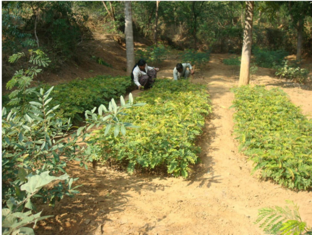
Weeding in the nursery at Gandhivan: preparations for new plantation

The plant species planted in the gullies and nullahs include Acacia nilotica (Babool), Leuceana leucociphla (Subabool), Zizuphus jujube (Ber), Ailanthus excelsa (Ardu), Prosopis cineraria (Khejari) etc. Because of their fast growing nature the plants provided a lot of fodder and fuel during the year, which became a good support for the community people of the area.