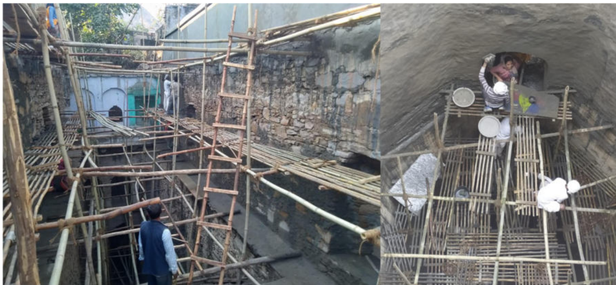
Repairing the infrastructure of inside walls and the well

The Sayeed Baba ki Bawari or Sayeed step well is related to Lakkhi Banjara (an old time famous nomadic trader of salt and grains in India) who has been very famous in Rajasthan and several stories of his liberal nature and munificence are prevalent in the rural society of Rajasthan. Lakkhi Banjara was a big roving merchant of cattle i.e. sheep, camel, bullock, goat and salt etc. of that time. He is popular for his charity deeds. He constructed number of wells, step wells, saray (rest house for travelers and pilgrims), temples etc. in many villages. Also, he is known for helping poor people to get their daughters married and lending money to the people in need for their important works.