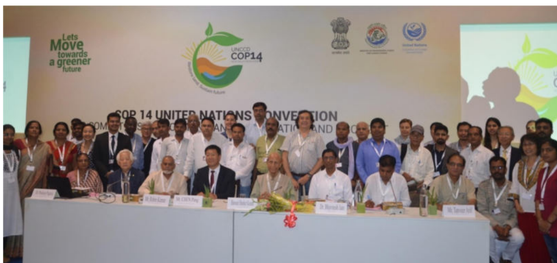
Group of participants in the GBS' side event held on cultivation of desert species in Asia

GBS organized a side event on “Afforestation and cultivation of drought resistant species in Asian Countries” in collaboration with China Green Foundation, China on September 07, 2019.