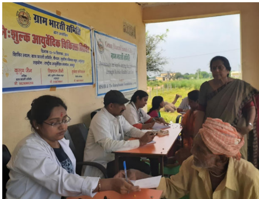
Health cam organized at Arjunpura supported by NIA