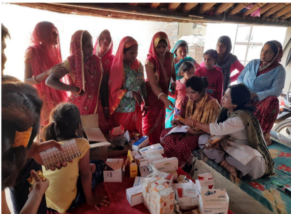
The Nurse diagnosing the patients and dispensing medicines in Shivpura

Generally the women were found infected with eczema, leucorrhea, night blindness, several kinds of PIDs. Most of them were anemic as they can't afford nutritious food and ignorant of usefulness of locally available herbal edible food, mainly the vegetables found in their vicinity.