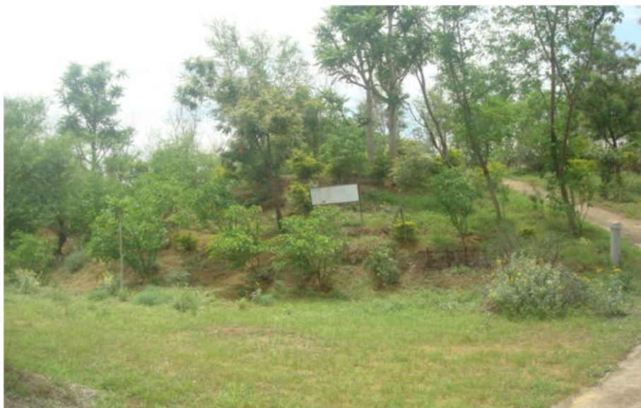
A successful attempt of stabilizing sand dunes through bench terracing