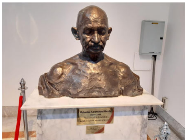
A statue of Mahatma Gandhi at UN office in Bangkok (Thailand)

In 2018, ESCAP and SIDA developed a joint project “The value of empowerment and participation on implementing the 2030 Agenda for Sustainable Development.” The overall goal of the project is to improve the understanding and access to knowledge of target stakeholders on the impacts and value of empowerment, including public participation, for strengthening implementation of SDGs in Asia and the Pacific, particularly on the environment-related Sustainable Development Goals (SDG 2, 5, 6, 7, 12, 13, 14, 15 and 16).