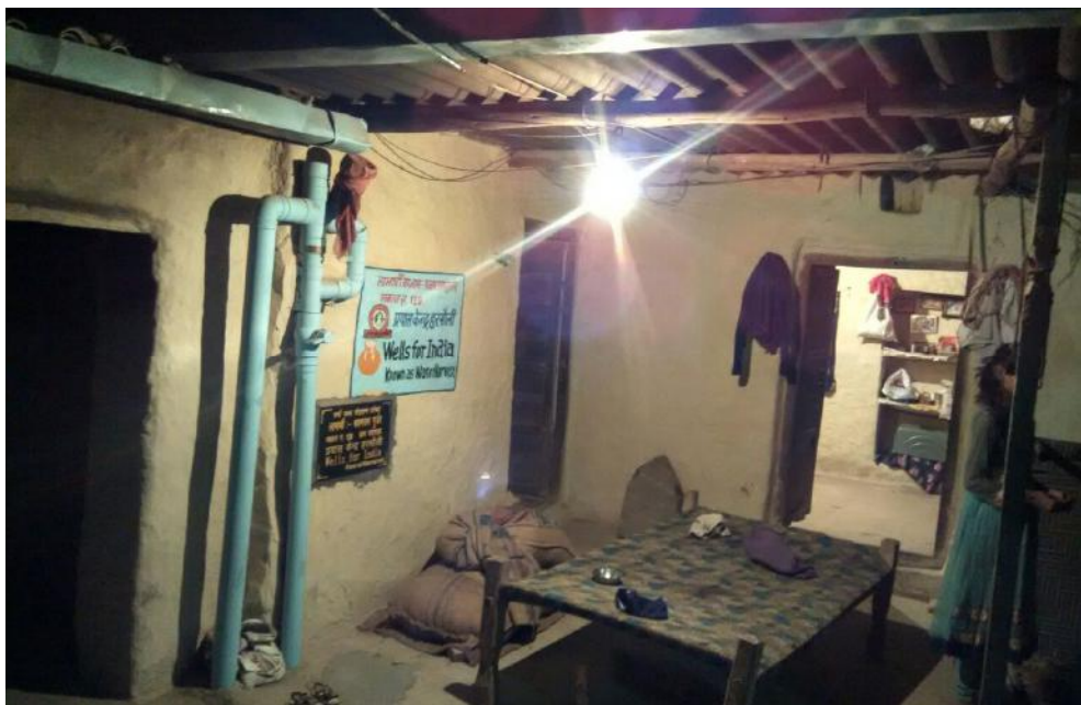
A low cost device for harvesting roof top rain water in Charasada

Bhawani further told that all the people of 230 villages of the area are facing acute problem of safe drinking water being the water saline in the area due to the Sambhar salt lake. He said they are in search of funding agencies to get support for replicating this project in these villages.