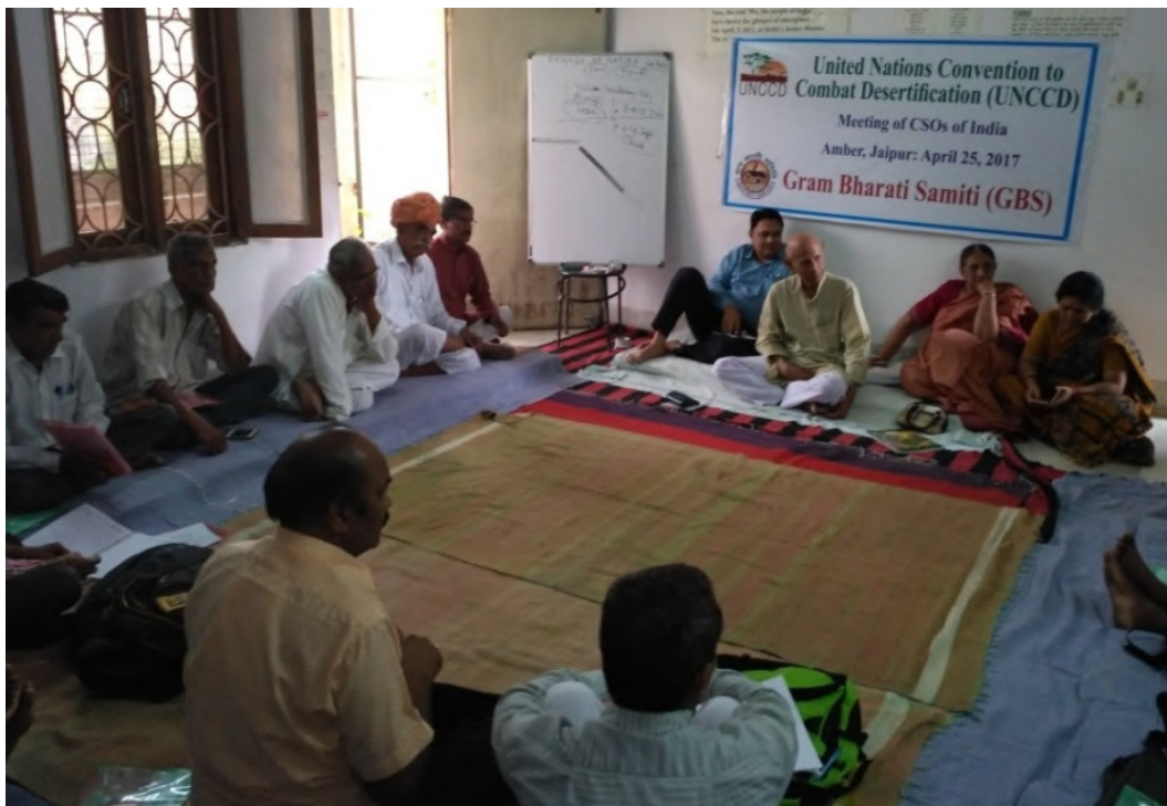
CSO representatives interacting in a meeting held at GBS office in Amber