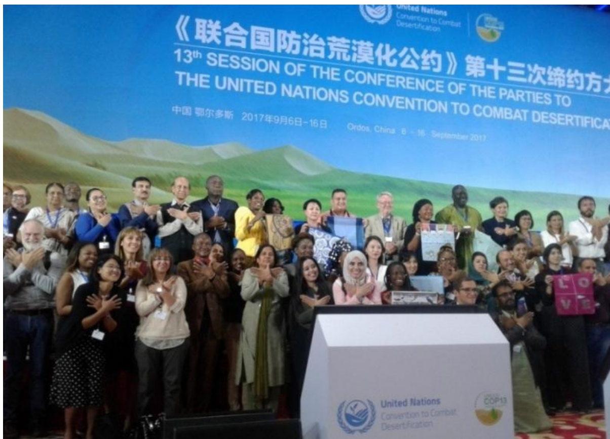
CSO delegates on dais of COP13 showing their integrity towards UNCCD