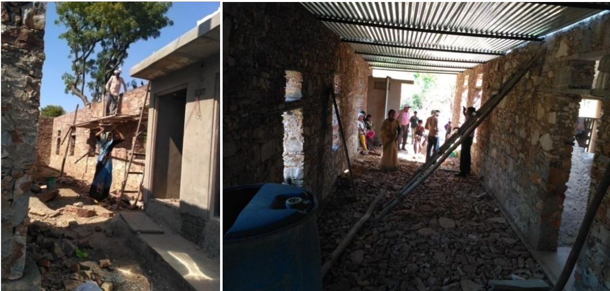
The work shed being constructed in village Pawta for women's training