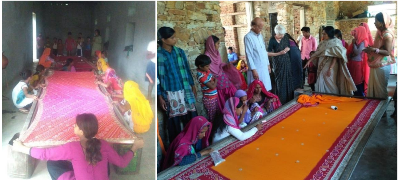
Trainee women learning embroidery (left) while Monikaji viewing their craft (right)

In the second round the women artisans were provided with training on application of various designs and developing skill to use different sizes, colors and type of raw materials etc. that they grasped gradually.