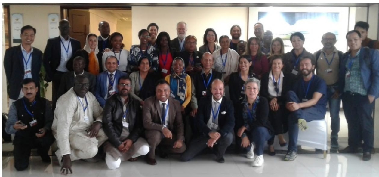
International delegates together with CSO panel members at COP13 Ordos, China

Thirty personnel of NGOs accredited with UNCCD from Asia applied for scholarship to participate in the COP13 to be held in Ordos, China on 6-16 September, 2017, but following ten of them including three from India could get scholarship: