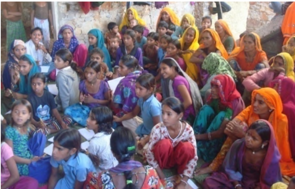
Women rejoicing the completion of the work shed