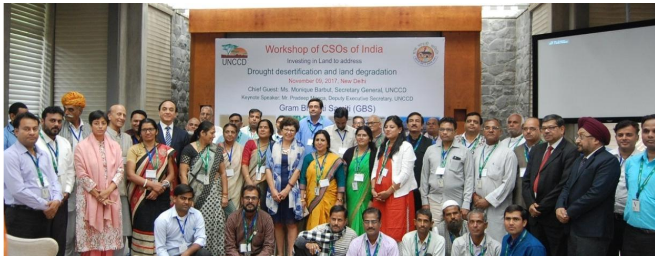
CSO participants in a group after concluding session of the meeting