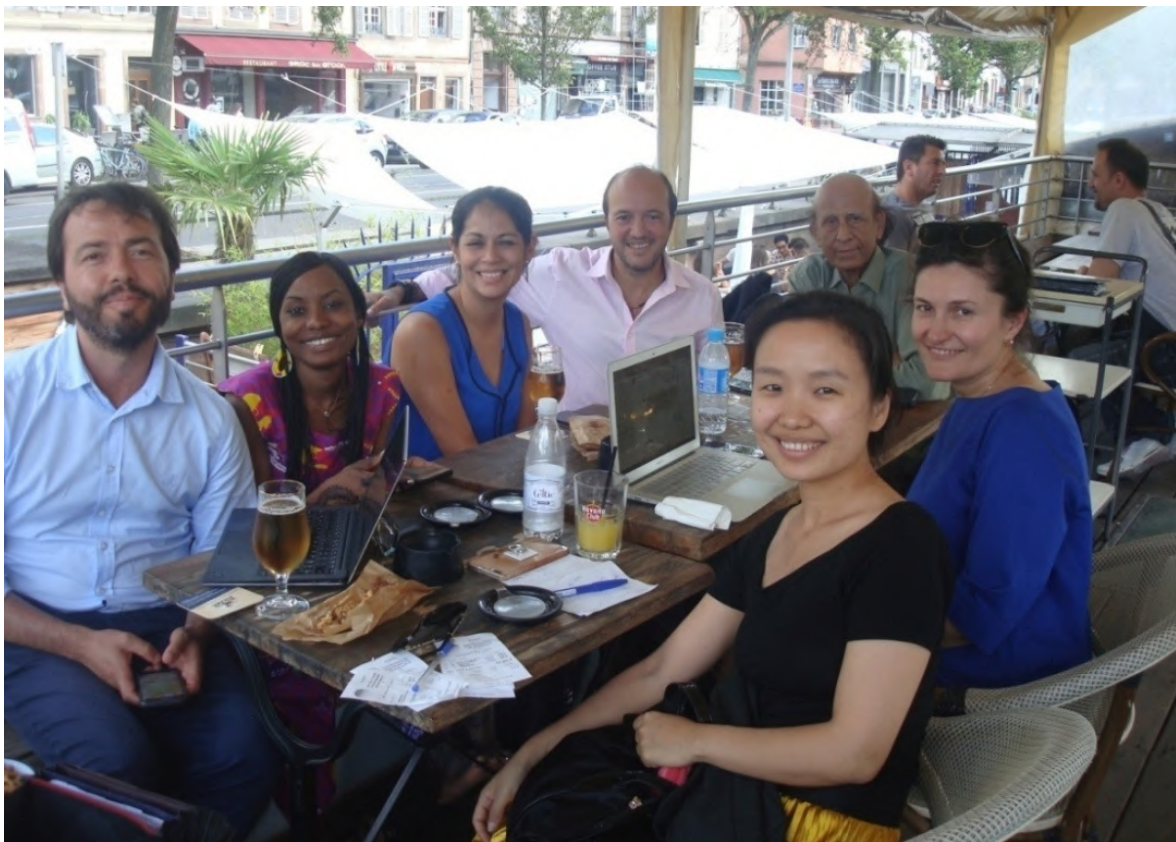
CSO panel members discussing their role in the implementation of UNCCD